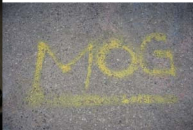
Summer Street Painting