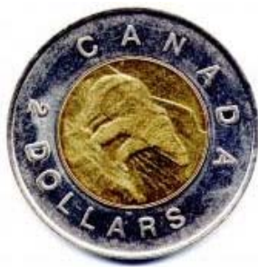
THE "TOONIE TRIBUTE" MADE A BIG IMPACT