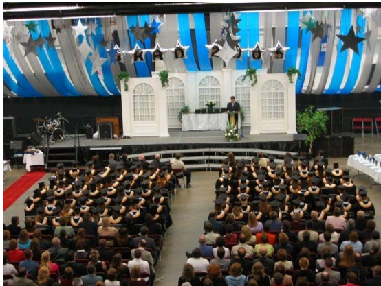
Graduating Class of 2005