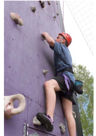
What's your mountain to climb?

Thank you to all of the original donors & for your continued Support!